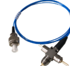
RGB White Pigtail Laser (Triplex)