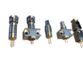
Fiber Detachable Laser Module