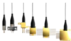
Fiber Coupled Laser Module